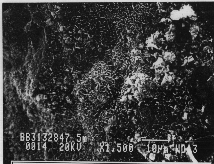
Figure 4B Blackback 3 2847.5m (plug 13) Illitic diagenetic clay coating pore walls. At reservoir conditions this clay is probably more fluffy, extending across pores creating a permeability barrier.