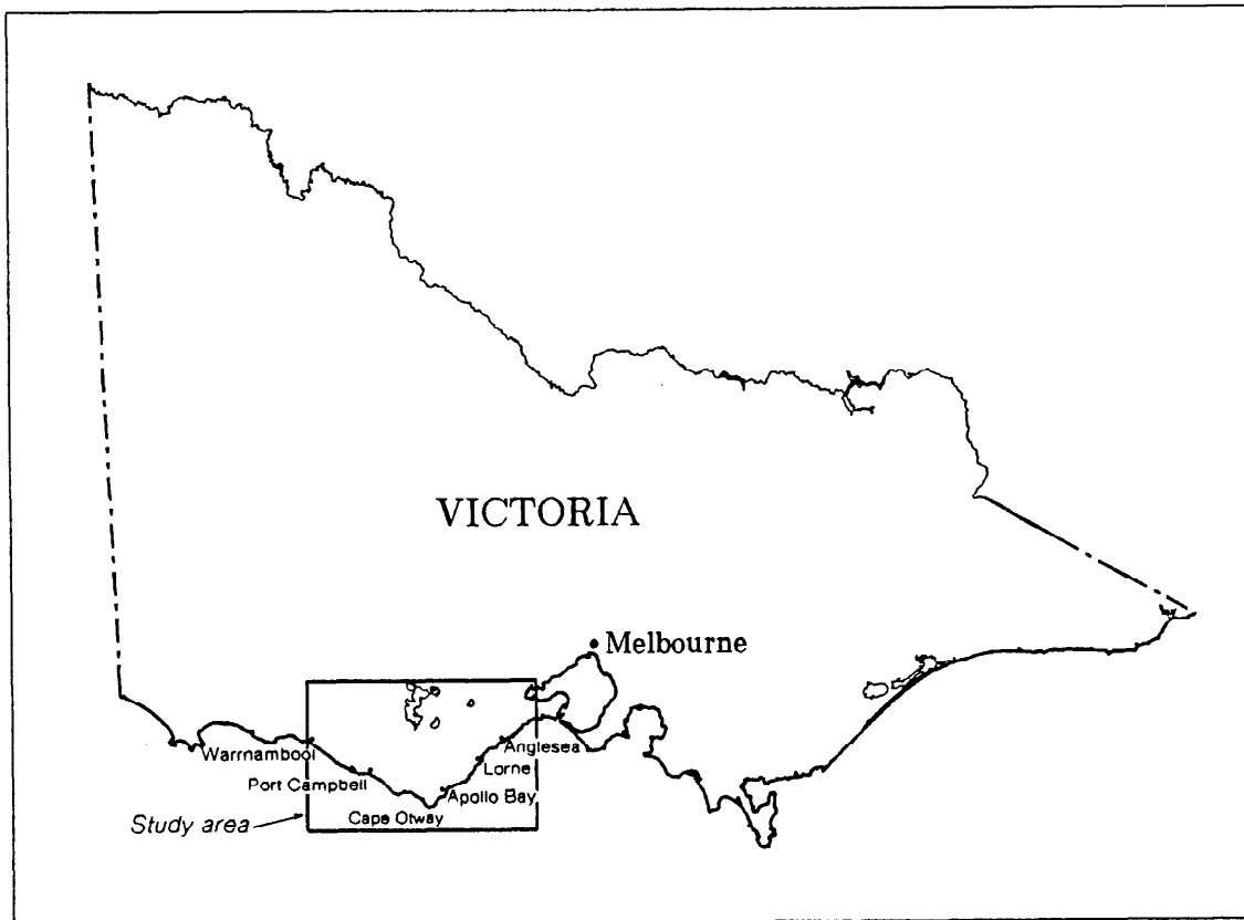
Figure 1 Location Map