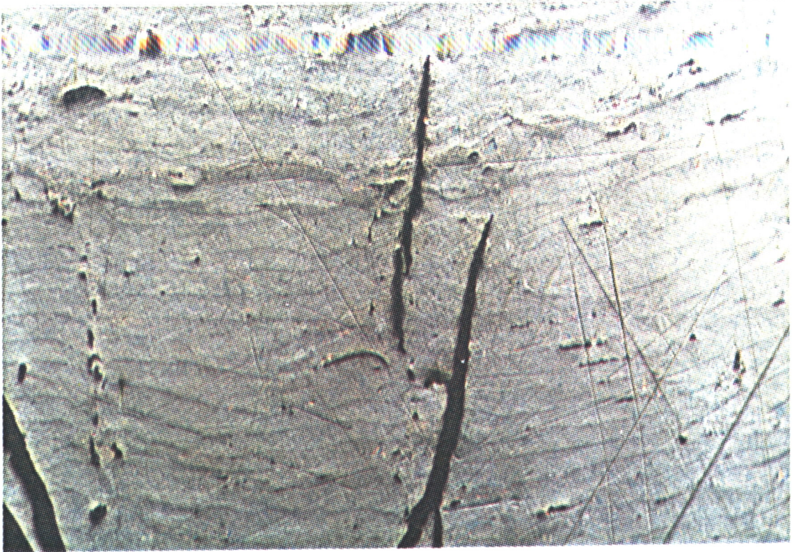
Plate 1: 3060 - 3065 m