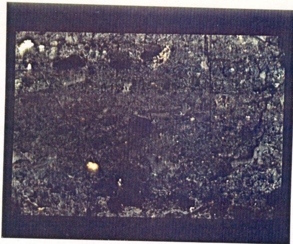
PLATE 3: 1164.5 m