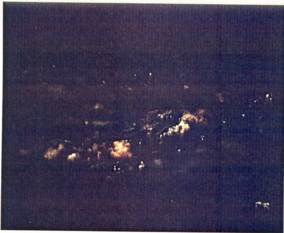
PLATE 1: 1260 m