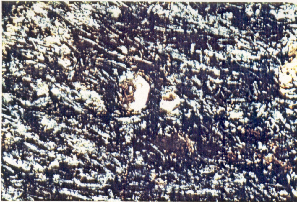
PLATE 5: SAMPLE SWC12 - FLUIDAL TEXTURE ENWRAPPING CARBONATE XENOCRYSTS IN POLARISED LIGHT. (x28 magnification)