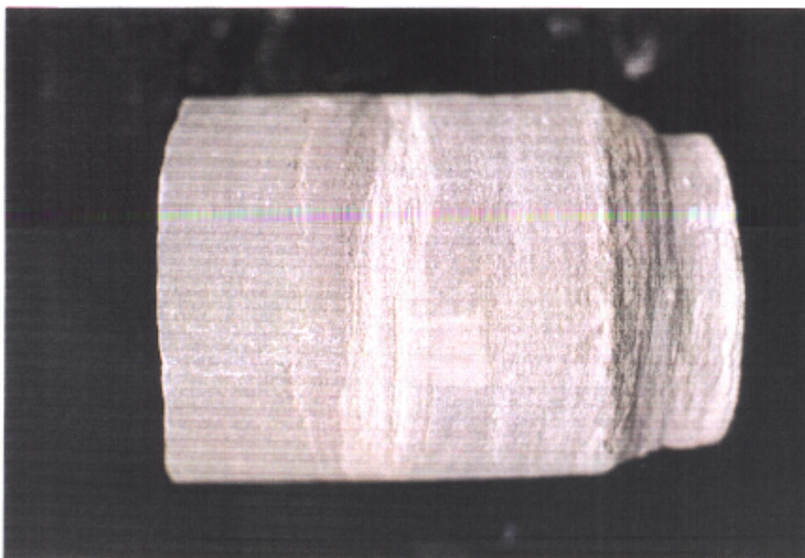
Detailed section of Core 3: Showing a medium grey to medium dark grey siltstone, argillaceous to arenaceous, moderately hard, micaceous, quartzose, occasional large quartz grains, occasional light sandstone laminae, occasional claystone laminae, carbonaceous specks and occasional fossil plant material.