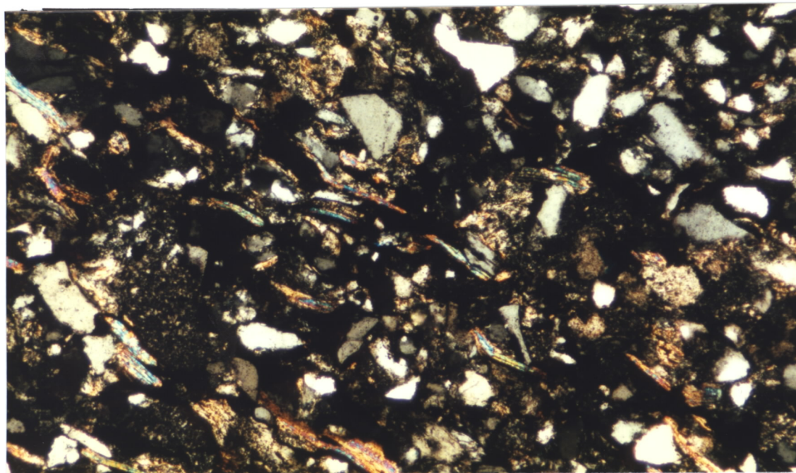
b. Crossed Nicols