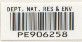
FIGURE : 2